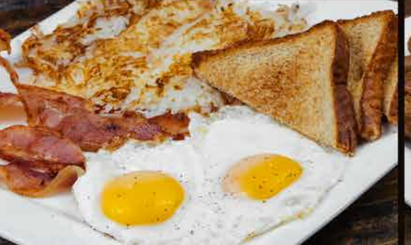
BACON & EGGS Bacon and eggs served with hashbrown and toast. 11.99

BREAKFAST Eggs, sausage, bacon and ham served with SAMPLER hashbrown and pancakes. 12.99