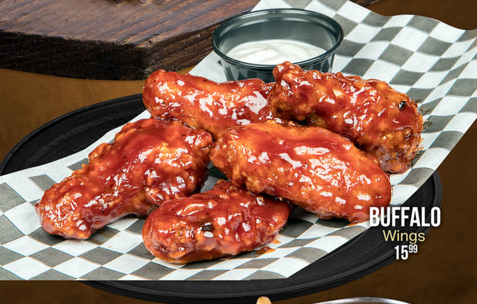
BUFFALO Wings 15 99