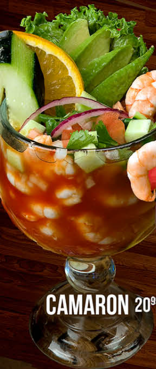
CAMARON 20 99