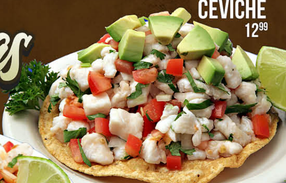
CEVICHE 12 99