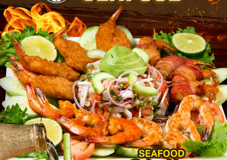
SEAFOOD Platter 49 99