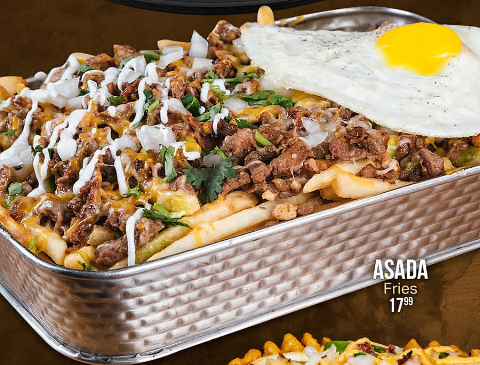
ASADA Fries 17 99