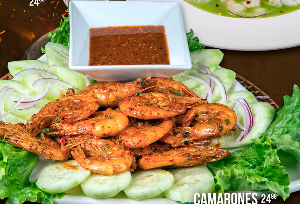
CAMARONES 24 99 Tatemados