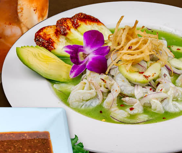
AGUACHILES 24 99