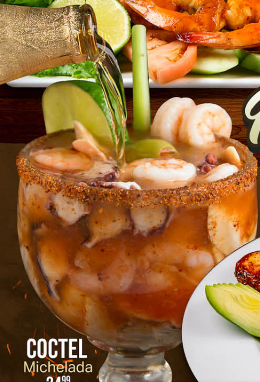
COCTEL Michelada 24 99