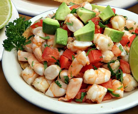
CAMARON 13 99