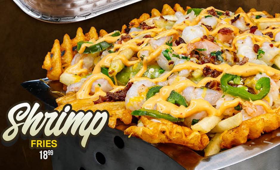
Shrimp FRIES 18 99