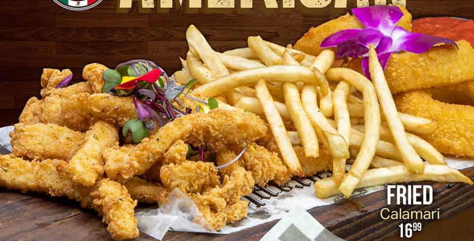
FRIED Calamari 16 99