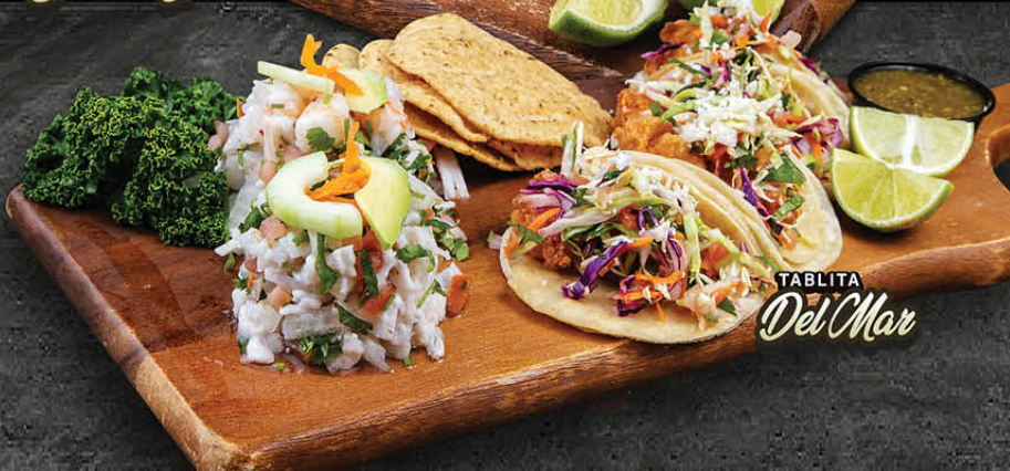
TABLITA Del Mar