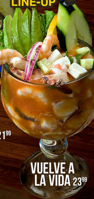
VUELVE A LA VIDA 23 99