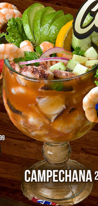
CAMPECHANA 21 99