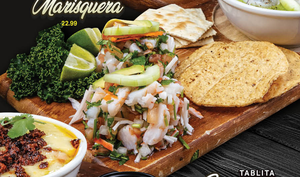
TABLITA Guadalajara 20.99