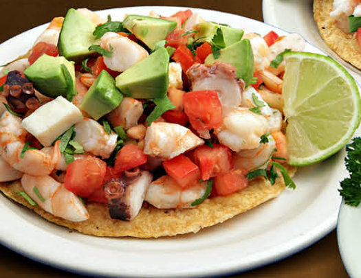
MIXTA 13 99