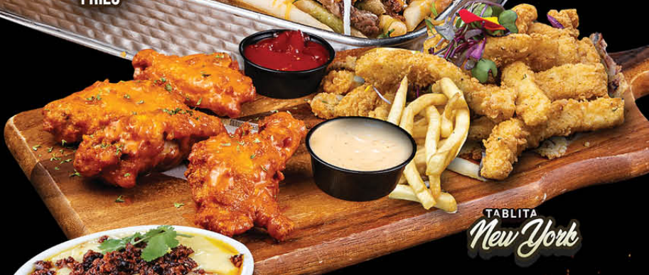
TABLITA New York